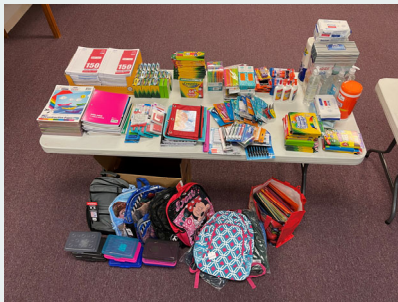
Each school received these items.