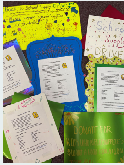
Signs created by the parish CYO.